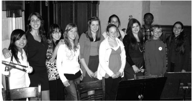
Mountainside United TM2 group joined by City View United.