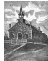
St Gabriel Street Church by Google

particularly on the protestant population. Many of the British soldiers were from Scotland serving in the famous Black Watch and Fraser Highland regiments and were happy to remain, marry and settle in Montreal or the surrounding countryside, having received generous grants of land from the Crown. Following both conflicts there was a surge of immigrants to Montreal, mainly from Scotland and Ireland but there were also many American families, known as United Empire Loyalists, who were still loyal to the British Crown or who saw business opportunities in Montreal and came to start a new life here.